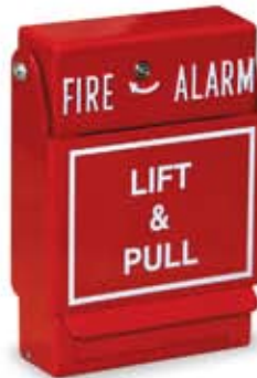
RMS ( ) LP