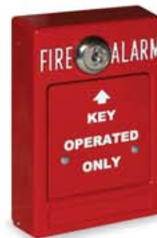
RMS ( ) KO