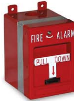
RMS-EXP ( )