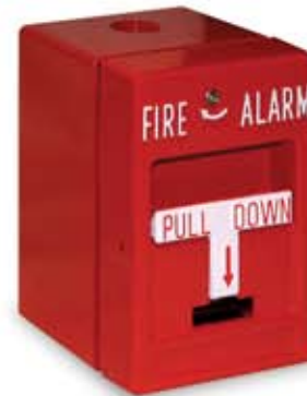
RMS ( ) WP