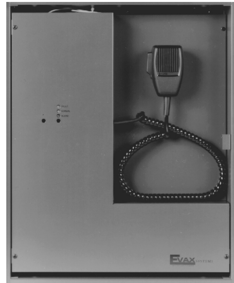
EVAX 100 shown with Keylocked Door Removed